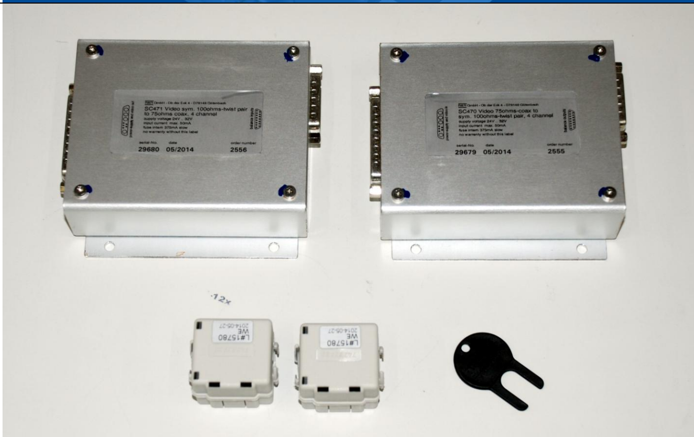
SCA470 + SCA471